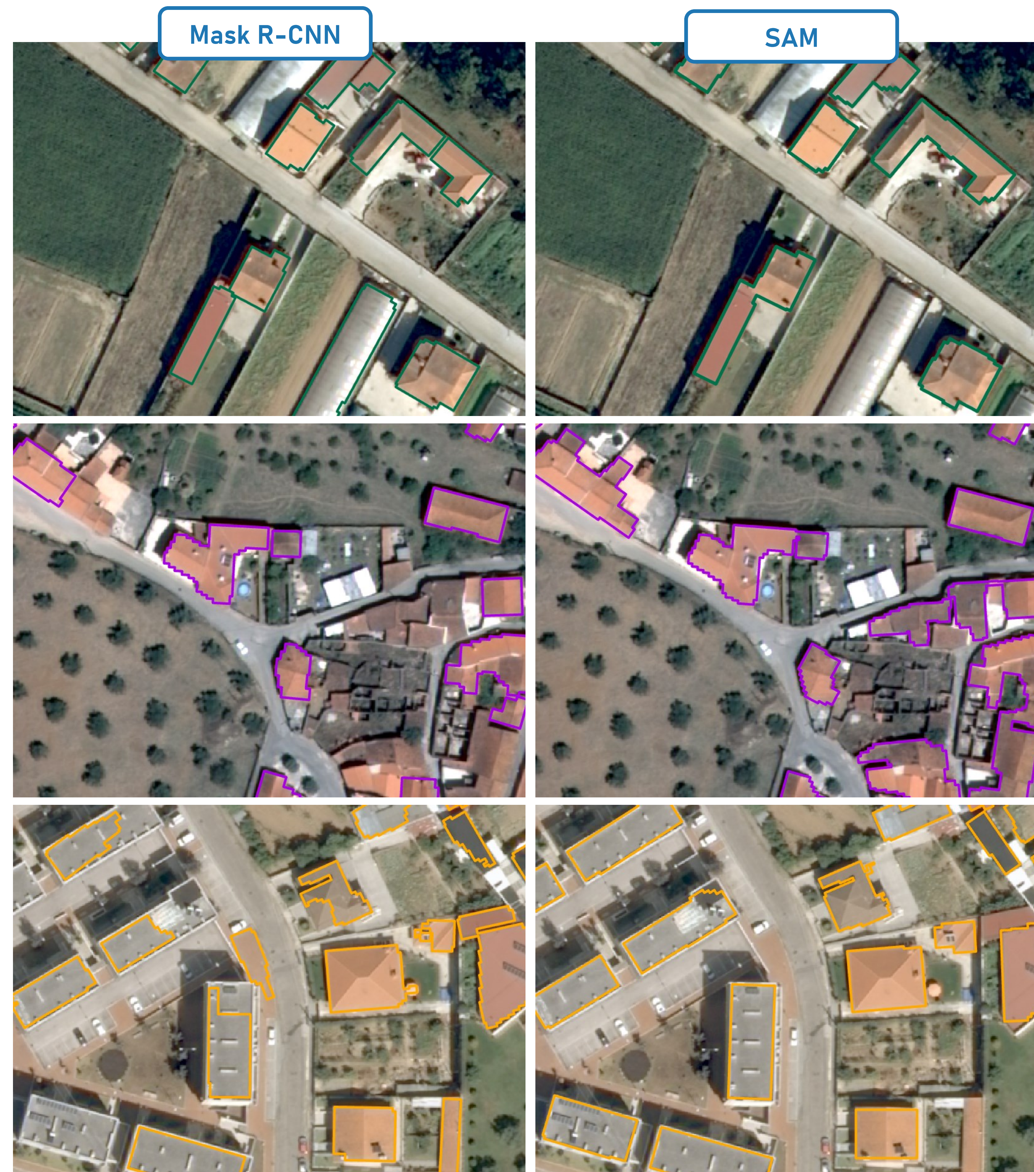
Figure 2. Inference Results: Mask R-CNN vs SAM

Accuracy assessment results for the Precision metric ranged from 0.81–0.94 for M-RCNN and 0.79–0.93 for SAM. IoU, measuring footprint overlap quality, varied from 0.62–0.75 (M-RCNN) and 0.60–0.83 (SAM) across TIPAU classes (Figure 3).